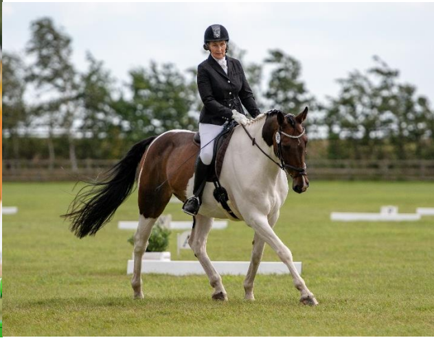
Grace & Ocus Pocus