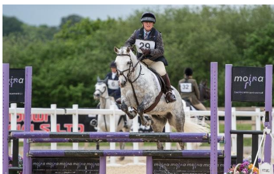
Frances - Bellindene Magnum

Dubai Quarry Bank Orion's Jaffa Copperfield Celebrity