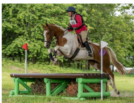
Kay – Something Special II