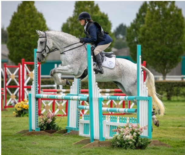
Susie & Dubai; 95 cm SJ